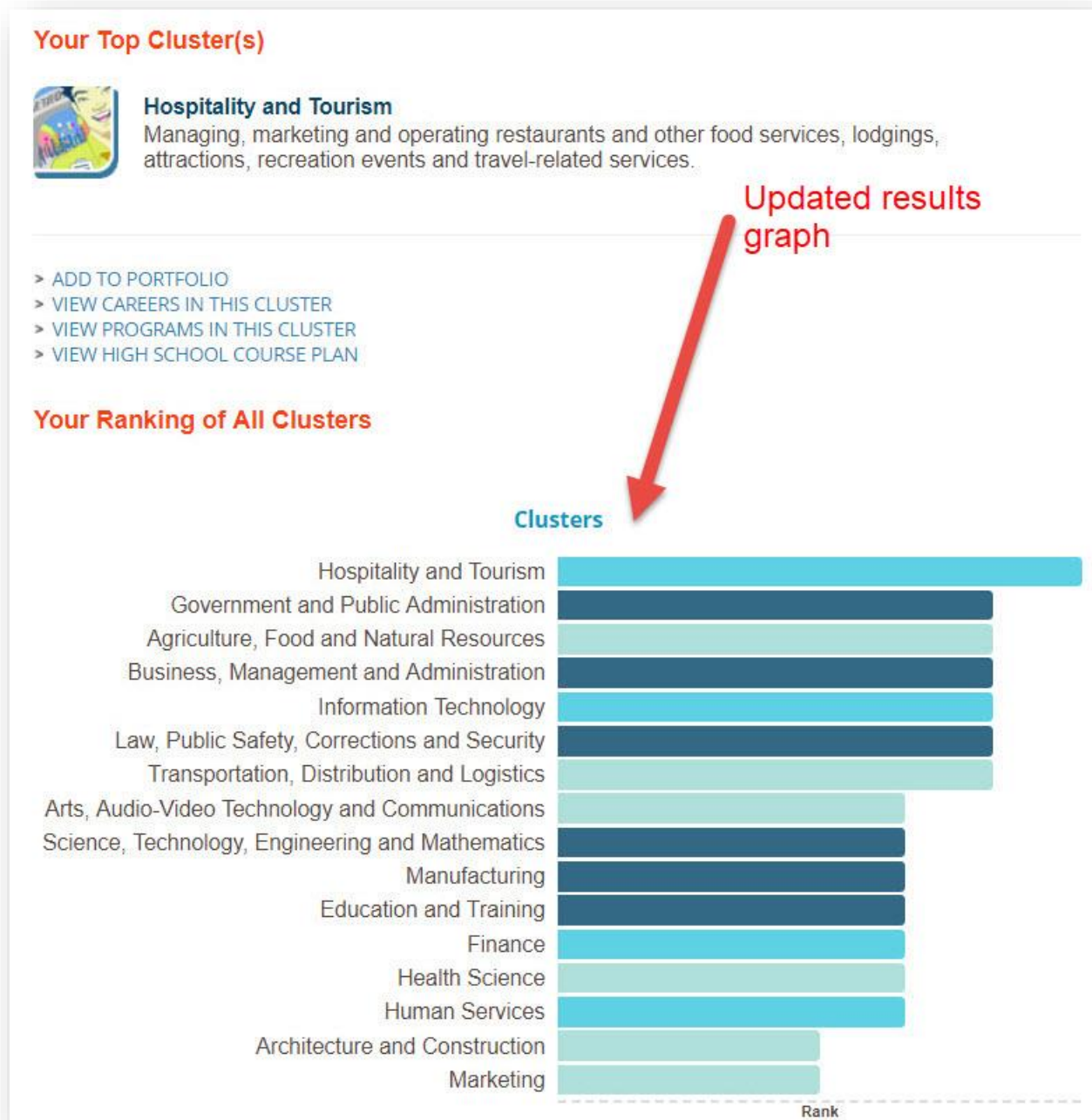
Updated Career Cluster Survey Results

The results graphs for the Career Cluster Survey and Basic Skills Survey now display without using Flash. The results will appear on the page without any need to run or install the Flash application.