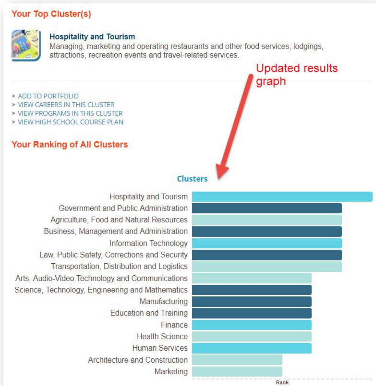
Updated Career Cluster Survey Results

The results graphs for the Career Cluster Survey and Basic Skills Survey now display without using Flash. The results will appear on the page without any need to run or install the Flash application.