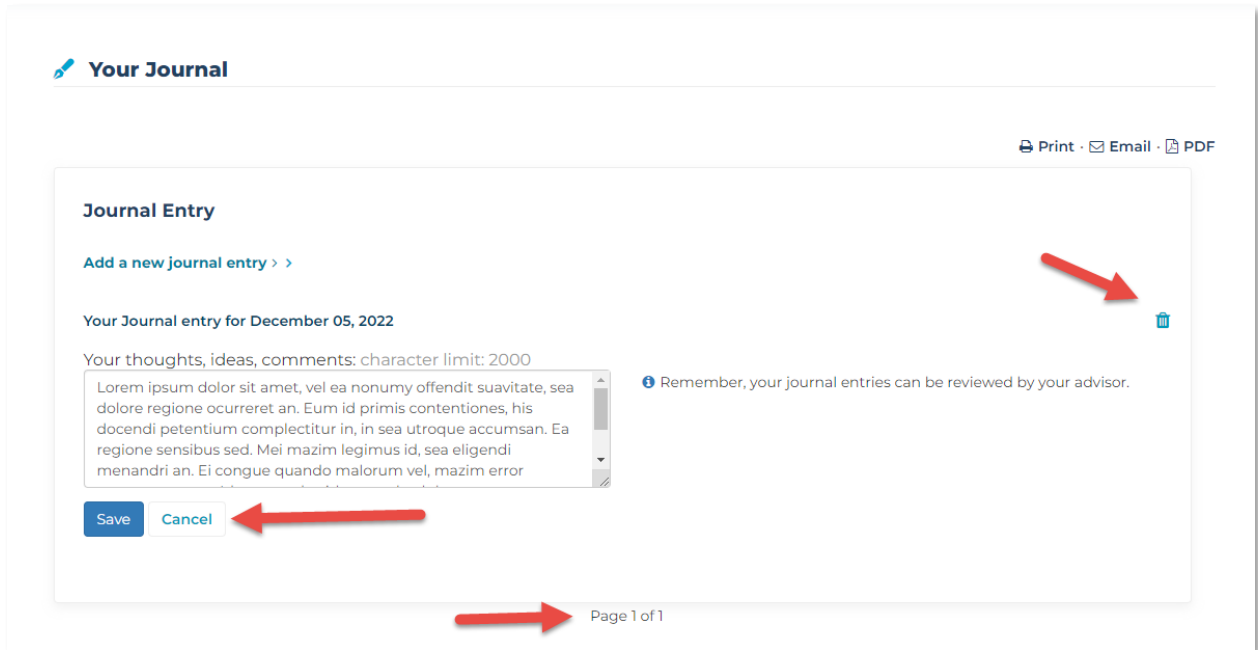
Your Journal Entry

The Your Journal styles have been updated to use new form and button styling when creating and editing a Journal entry. The text area has been increased for better useability. The delete text has been replaced with a trashcan icon. The pagination has been updated to match the new styling.