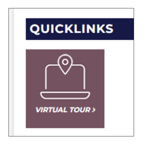
College virtual tour link

Links to virtual college tours when available have been added to college profiles in Choices360.com. Each college's link can be found in the QuickLinks section: